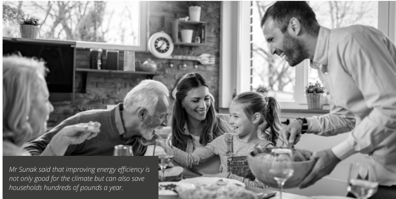
Mr Sunak said that improving energy efficiency is not only good for the climate but can also save households hundreds of pounds a year.